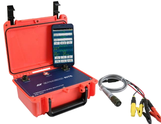
EDI-54V Vibrating wire indicator

The model EDI-54V vibrating wire indicator is a microprocessor-based read-out unit for use with Encardio-rite's range of vibrating wire sensors. It can display the measured frequency in terms of time period, frequency, frequency squared or the value of measured parameter directly in proper engineering units. It uses a smartphone with Android OS as readout having a large display with a capacitive touch screen which makes it easy to read the VW sensor.