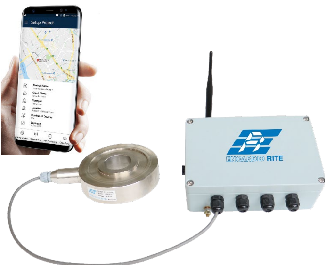
Resistive strain gage type center hole load cell connected to model EWN-04A analog node

The node is tested in terms of its measurement precision and its wireless communication performance. It is housed in a rugged enclosure designed for use in harsh environments with wide temperature tolerance with resistance to moisture and humidity.