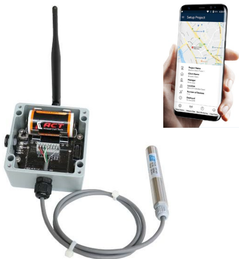
Vibrating wire piezometer connected to node

The node is tested in terms of its measurement precision and its wireless communication performance. It is housed in a rugged enclosure designed for use in harsh environments with wide temperature tolerance with resistance to moisture and humidity.